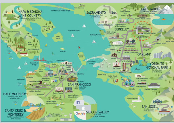
Illustrated by Krystal Lauk, with permission for use from Berkeley Law

UC Berkeley is located in the city of Berkeley, California, a mid-sized city known for its progressive policies and viewpoints, and is a hub of creativity and counterculture. It is just 20 minutes from iconic San Francisco. UC Berkeley is in close proximity to many famous sites, such as the Pacific Coast, the Golden Gate Bridge, Silicon Valley, Yosemite National Park, and the Sonoma and Napa Wine Country.